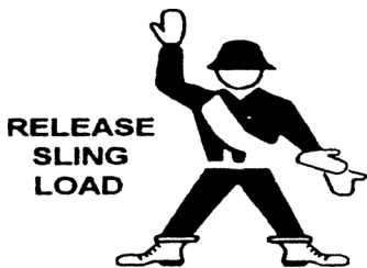
RELEASE SLING LOAD

Arms extended, palms up; arms sweeping up.