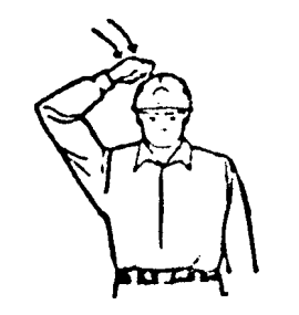
USE MAIN HOOK