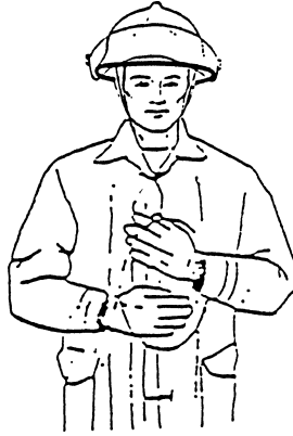
AHEAD OR BACK UP

Hold hand directly in front, chest high, fingers on hands directed toward one another, and motion in a circular "come-on" gesture. At night hold a flashlight in one hand and direct the beam toward the other.