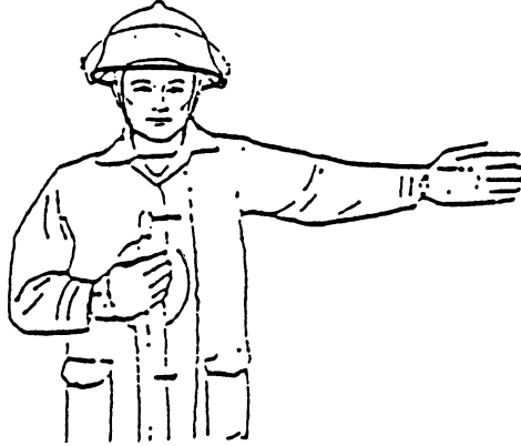
RIGHT OR LEFT

Point in the desired direction with one hand and motion in a circular "come-on" gesture with the other hand at the chest level. At night direct a flashlight beam at the hand pointing in the desired direction.