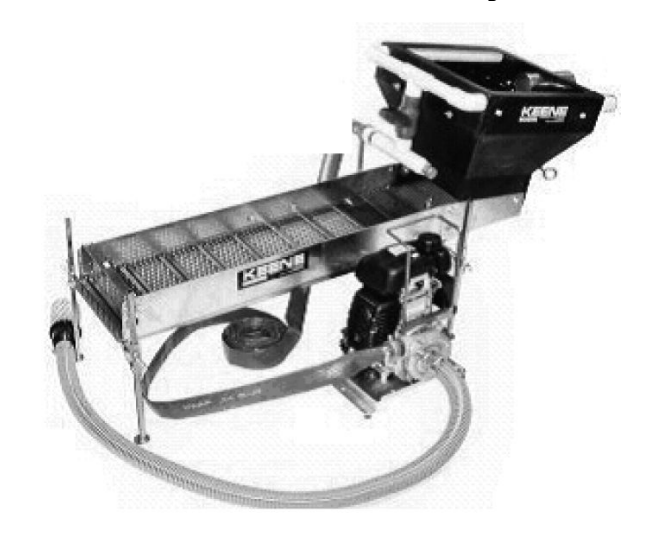
Figure 1: High-banker