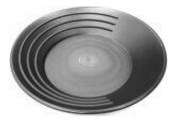
Figure 4: Pan