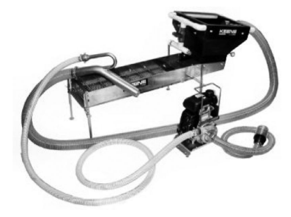
Figure 5: Power sluices/suction dredge combination