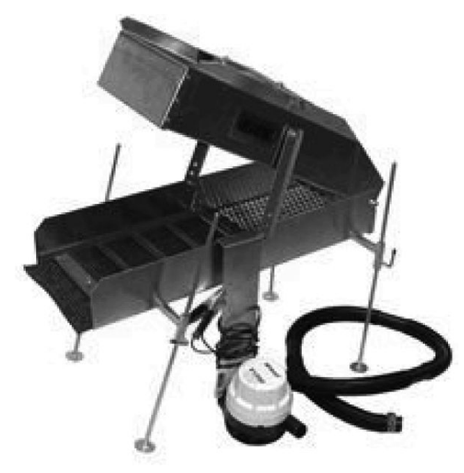
Figure 2: Mini high-banker

(99) "Mini rocker box" means a rocker box with a riffle area of three square feet or less. See Figure 3.