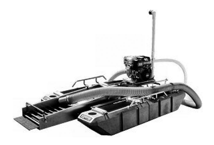
Figure 10: Suction dredge