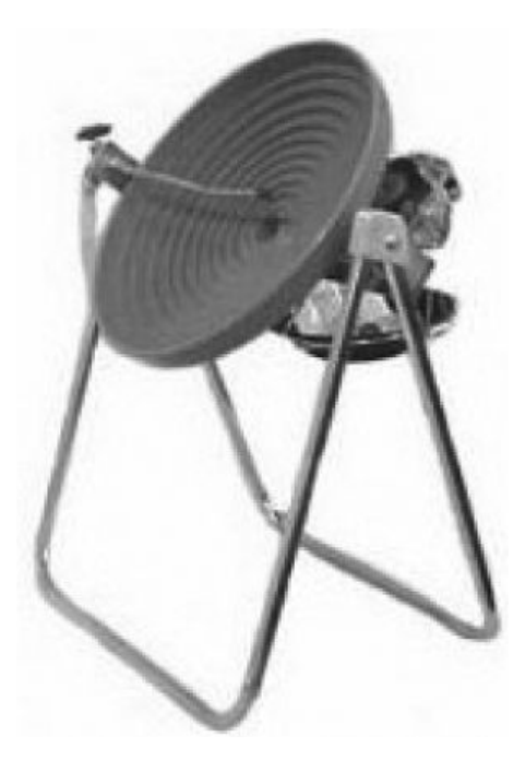
Figure 9: Spiral wheel