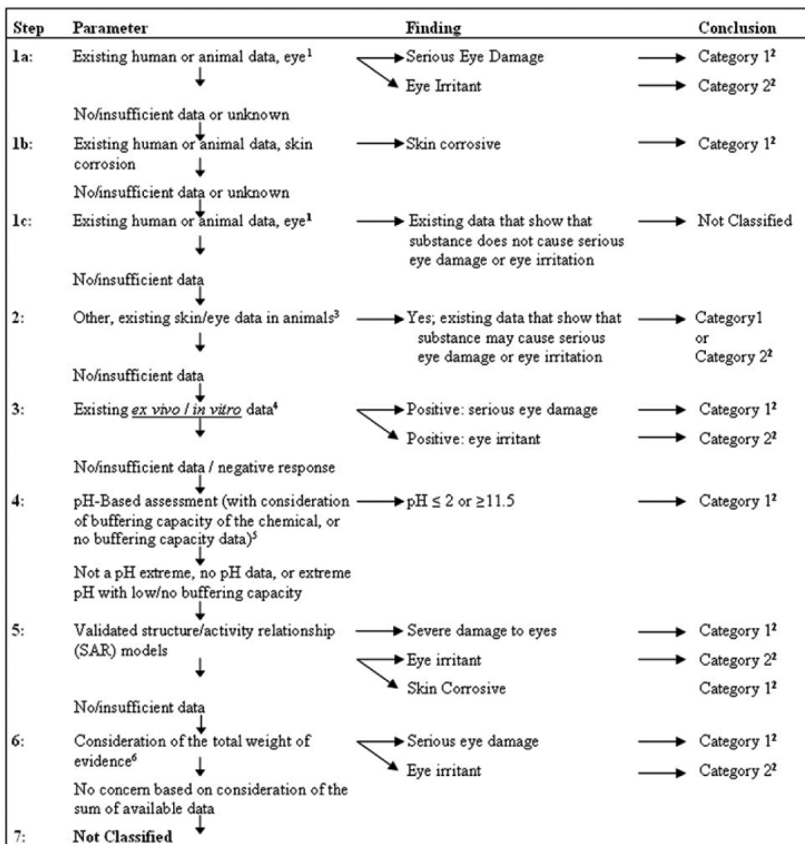
Figure A.3.1 Evaluation strategy for serious eye damage and eye irritation (See also Figure A.2.1)