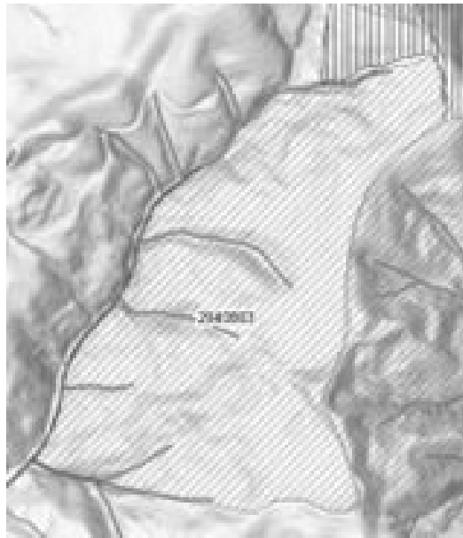
Fig. 2 map of the backup site, FPA 2940863. This backup site was provided by the landowner in January 2024 and has not yet been evaluated in the field.