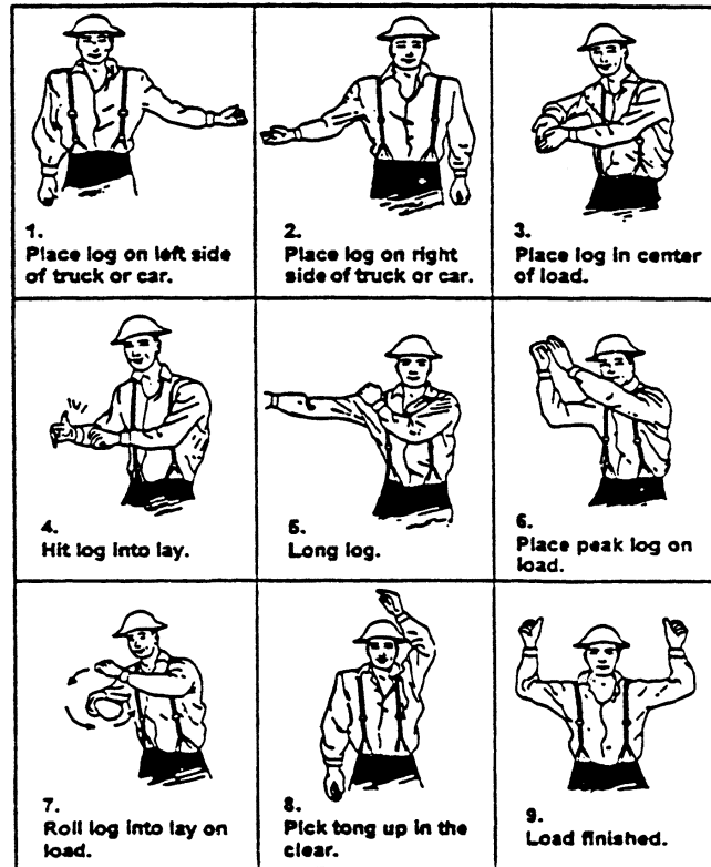
Figure 42: Standard Signals for Loading Logs