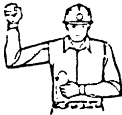
FOR MOBILE CRANES LOCK THE CRAWLER BELT ON SIDE INDICATED BY RAISED FIST TRAVEL OTHER CRAWLER BELT IN DIRECTION INDICATED BY REVOLVING FIST