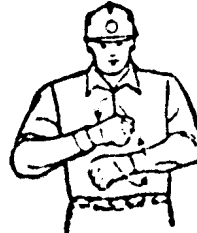
FOR MOBILE CRANES TRAVEL BOTH CRAWLER BELTS IN DIRECTION INDICATED BY REVOLVING FISTS

[Statutory Authority: RCW 49.17.040 and 49.17.050. WSR 86-03-064 (Order 86-02), § 296-56-99003, filed 1/17/86; Order 74-14, Appendix D (codified as WAC 296-56-99003), filed 4/22/74; Rules (part), filed 9/24/65; Rules (part), filed 3/23/60.]